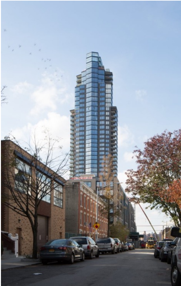
21 India Street

Above that, the residential units offer uninterrupted views of the East River and the New York skyline in all directions. Residents will have private balconies that face Manhattan, Brooklyn and Queens, and each unit offers floor to ceiling glass windows creating maximum exposure to the morning sun, or sunset behind the skyscrapers of Manhattan.