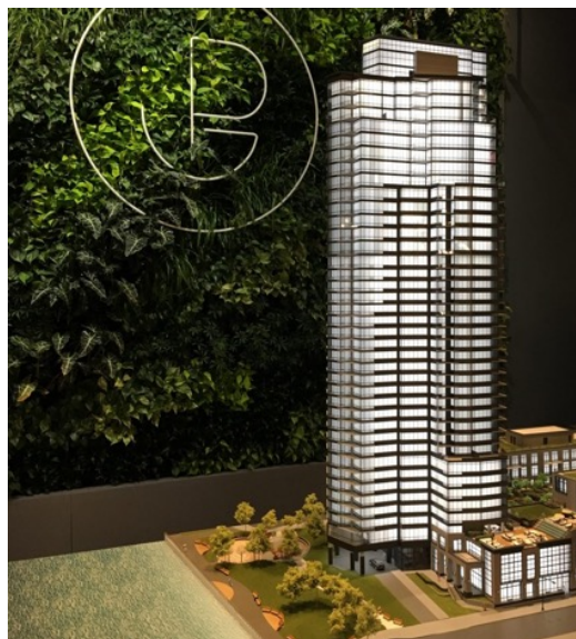
The Greenpoint, 21 India Street, building model at sales gallery

Among the new towers rising along the Brooklyn waterfront, The Greenpoint, which has already topped out, is among the tallest in its eponymous neighborhood . Cladding has reached the top of the 40-story residential building, interior work is currently underway, and today, YIMBY has a look at the views from within.