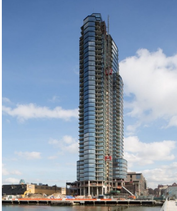
21 India Street