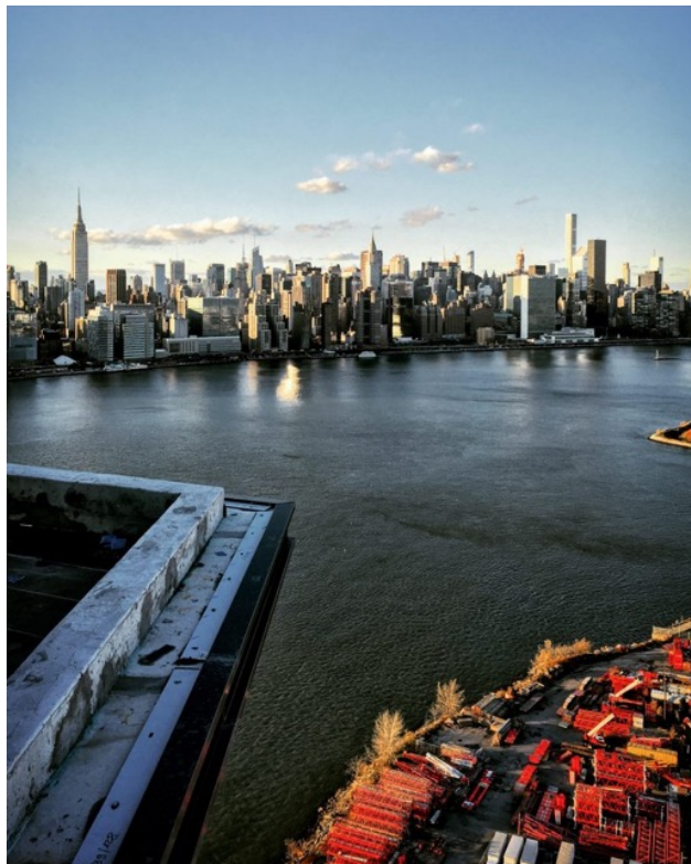
View of midtown at sunset

Sitting above the building's podium levels is "The Greenpoint Gardens" which include outdoor patios, dining areas, outdoor and indoor terraces, a sun deck, multiple lounges and landscaped gardens and water features.