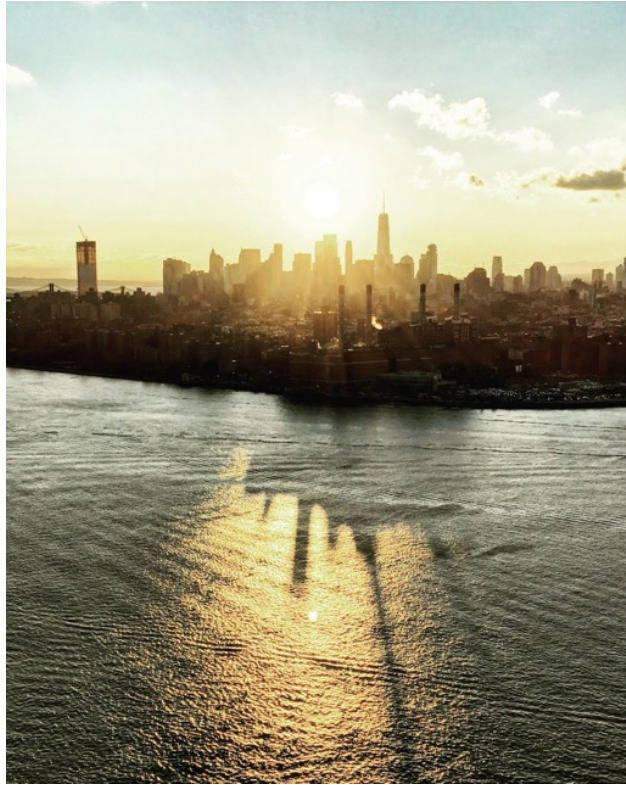
View of Lower Manhattan at sunset, photo taken by @mchlanglo793

Sitting above the building's podium levels is "The Greenpoint Gardens" which include outdoor patios, dining areas, outdoor and indoor terraces, a sun deck, multiple lounges and landscaped gardens and water features.